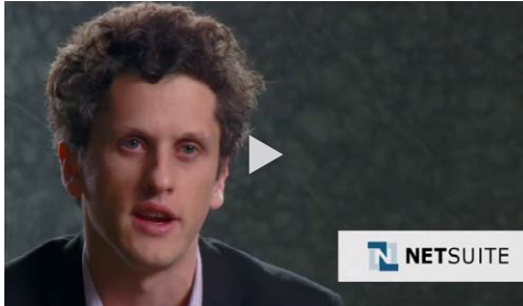
Box leverages NetSuite Cloud ERP as part of best-of-breed approach to business technology.