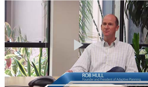
Adaptive Insights shares the keys to scaling a hyper-growth cloud company.